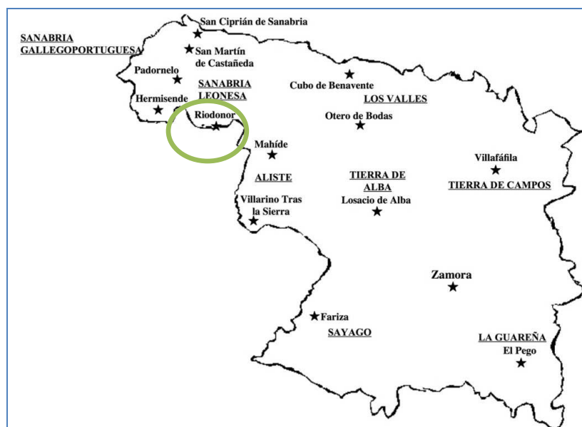
Figure 4. Zamora province survey points in the ALPI (González Ferrero 2007: 170).

González Ferrero (2007) includes the thirteen points in Figure 4 in his study. Here, however, I have decided not to include the data from Riodonor (circled in Figure 4). This village is on the border between Spain and Portugal and, according to the ALPI searchable database online, 6 this point is not among the points surveyed in this province. 7 Additionally, on page three of the Cuaderno I for this locality, the surveyor explains that at the time of the survey there was a “ Rio de Onor de Portugal ” on one side of the border with 40 inhabitants and a “ Rio de Onor de Castilla ” on the other side with 15 inhabitants and that there were close ties among the inhabitants of these two communities (e.g. marriage between members of both communities and properties on both sides of the border). If we take into account a mainly Lusophone population (40 vs. 15), the close ties between the two villages and the fact that the parents of the female speaker interviewed were Portuguese, it is easy to understand why the data from this point showed a high degree of Portuguese influence and why I chose to not include them.