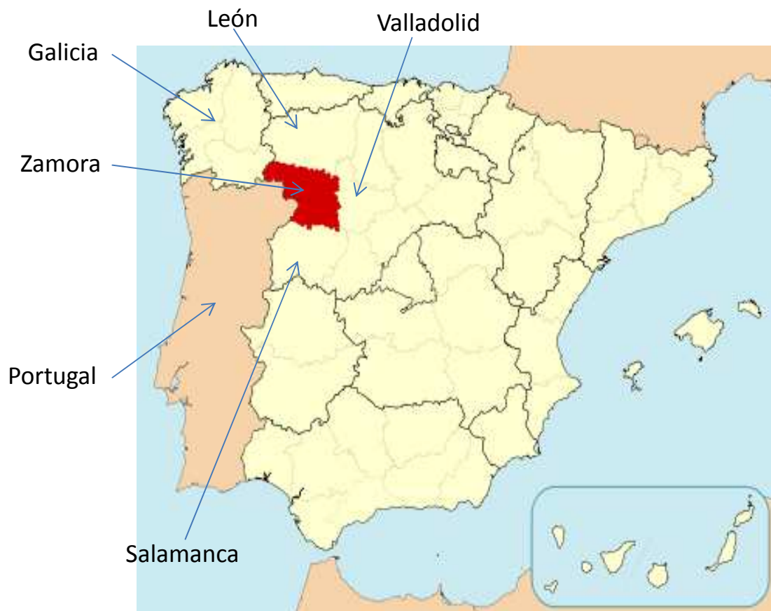
Figure 1. Zamora 4

Zamora province is located in the Northwest of Spain and belongs to the autonomous region of Castilla and León. This province borders with León province to the North, with Valladolid province to the East, with Salamanca province to the South, with Portugal to the West and with Orense (province Galicia) to the Northwest. It is this location between the province of León with its own dialect (Leonese), Galicia and Portugal with their own languages (Galician and Portuguese) and the two Castilian provinces of Salamanca and Valladolid that makes of Zamora an ideal place for dialectology and language contact research.