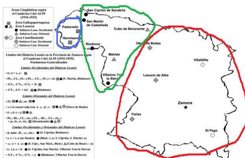
Figure 2. The three dialectal areas of Zamora province according to González Ferrero (2007: 200).

González Ferrero's (2007) study establishes the boundaries of the Leonese dialect in the province of Zamora at the beginning of the twentieth century and the different areas and subareas by using data from the ALPI Cuaderno I questionnaire. An in-depth analysis of each of the thirteen phonetic features chosen by this author and the comparison of his results with other previous studies allows González Ferrero to create a map with the precise limits of the Leonese dialect and to identify three different dialectal areas in the province. Figure 2 shows these three areas: Galician-Portuguese (in blue), Leonese (in green) and Castilian (in red).